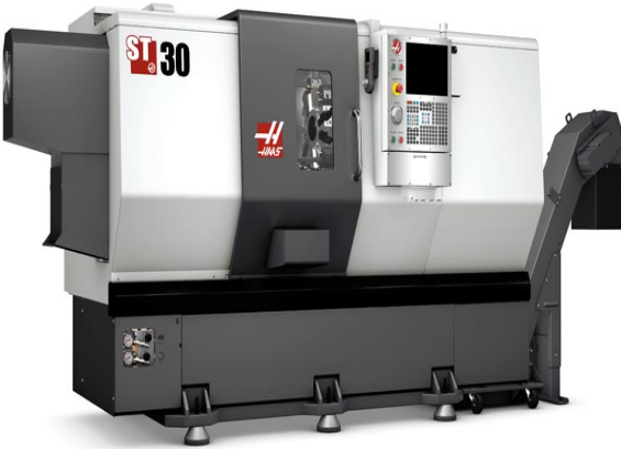
Hars Turning Center