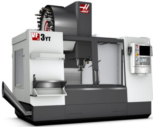
Hars Vertical Machining Center