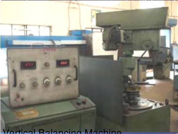
Vertical Balancing Machine