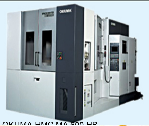
OKUMA HMC MA 600 HP