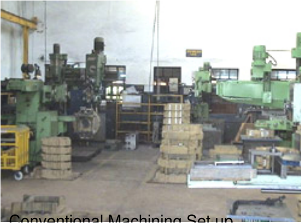
Conventional Machining Setup